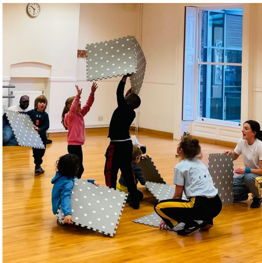
Coalesce Dance Theatre- 'The Old Green Time machine' R&D at NSCD Saturday School

CYPDNN is a support organisation for the dance sector in the North and we welcome contact, collaboration, partnerships and initiatives that forward our aims.