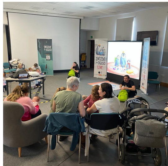
Hawk Dance Theatre and The Knotted Project- 'Inside the Igloo' at Crowle Library North Lincs